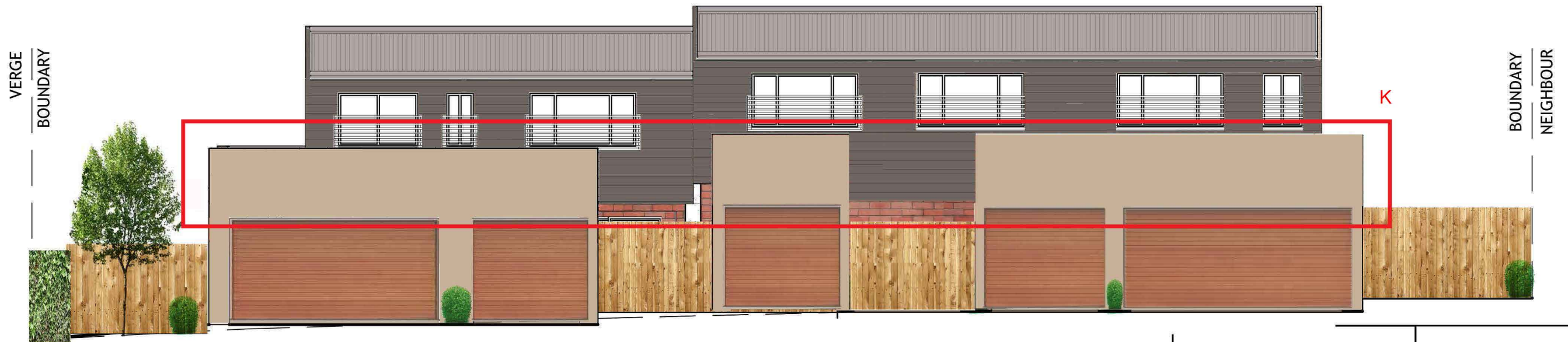
COMBINED NORTH ELEVATION